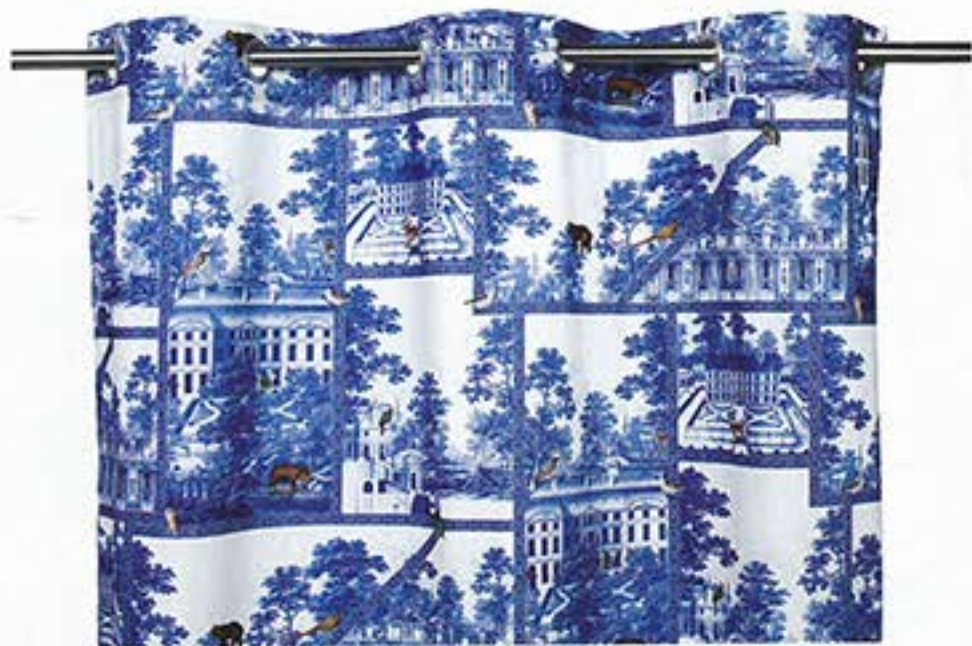
Lush landscape scenes in blue and white are punctuated by small-scale woodland creatures on the Bellecour curtain with grommets by Madura . B11-C-7