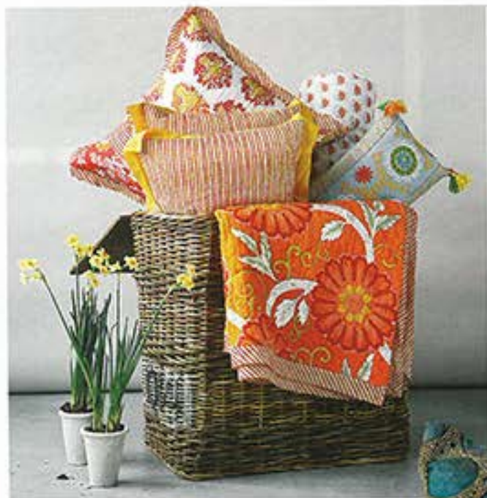
New top-of-bed designs from Creative Co-Op present a fresh take on florals, damasks and other classic patterns in a warm saturated color palette. B2-1003