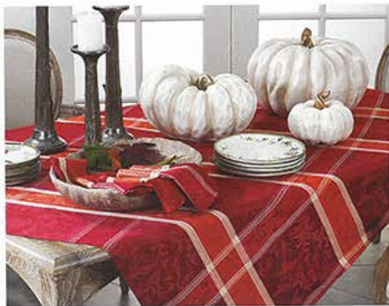
Elegant scrollwork and a crisp autumn-inspired color palette adorn the tablecloth and napkins from Saro's Pumpkin Collection, made of 100% polyester ($5, napkin; $49, tablecloth). B19-E-7, 9-D-10