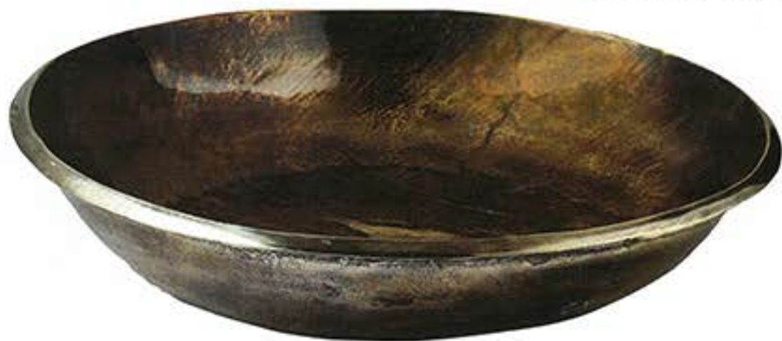
Julia Knight reclaims the imperfection of nature with the one-of-a-kind Eclipse bowl, boasting an asymmetric form and burnished bronze finish over steel ($250).