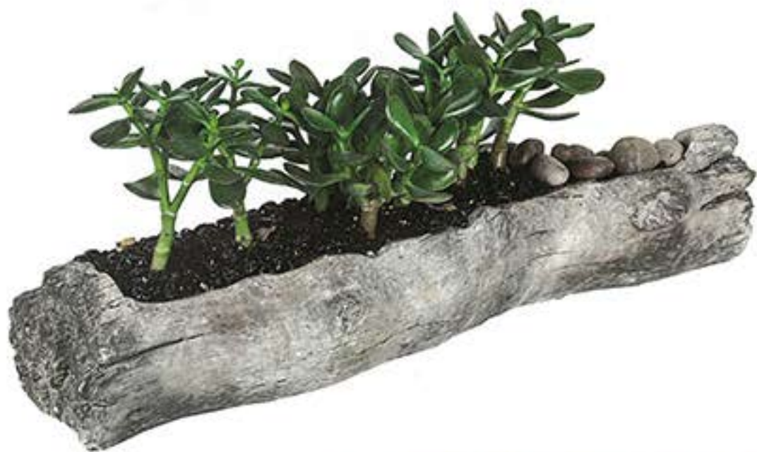
Crafted from cement, Abbott's Jurassic log planter looks remarkably like the real thing with artful distressing ($65).