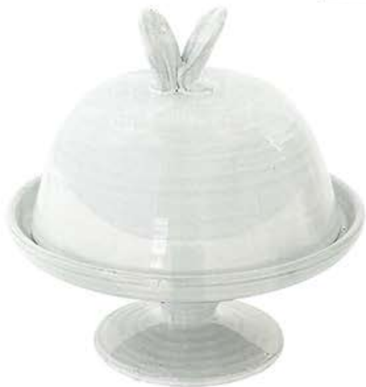
Creative Co-Op adds a witty element to a simple terracotta cake stand with frolicsome rabbit ears ($80).